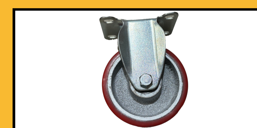
Fixed Direction Casters