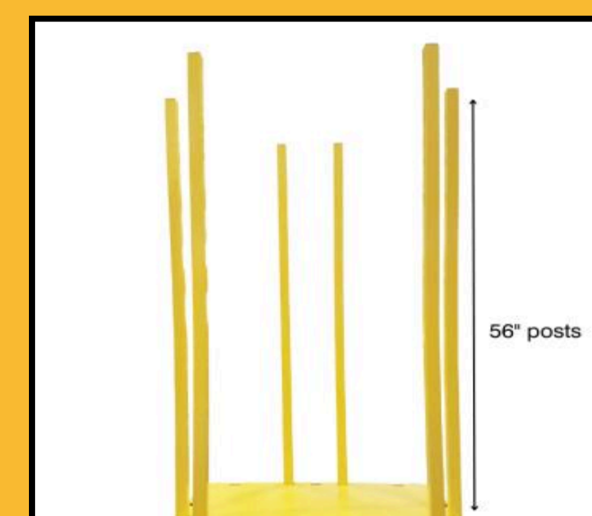
56" Posts (2 Set)