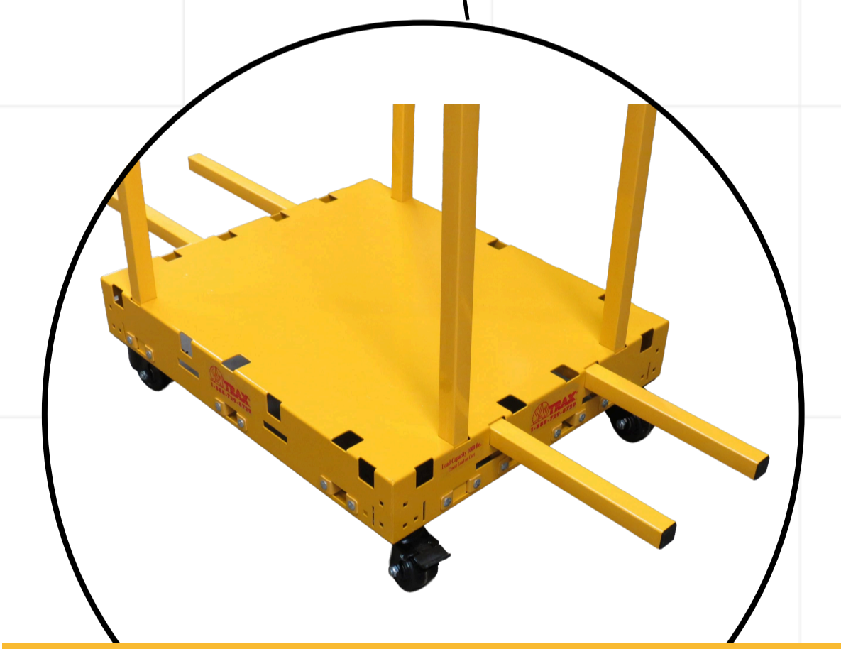
Posts can be Used Vertically or Horizontally