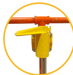
VERTICAL MOUNT OPTION

Workflow Ready: Reach tools are pre-positioned exactly where you need them.