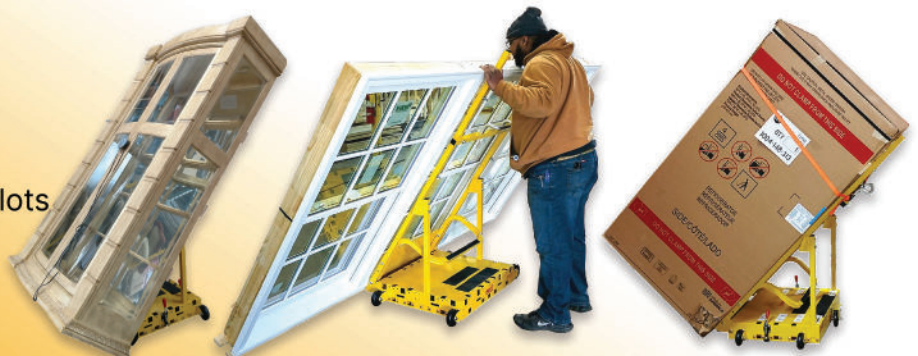
See opposite side for accessories shown on above Scoop Dollies

Follow us on social media! Scan the QR code for more info.