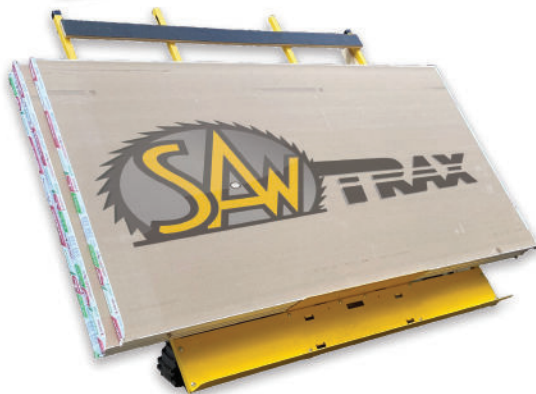
Motorized Job Site Scoop Dolly shown with the optional Drywall Lip, which allows for carrying multiple objects