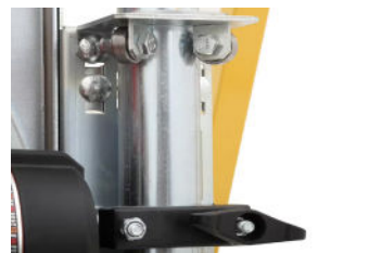
Sealed Steel Roller Bearings