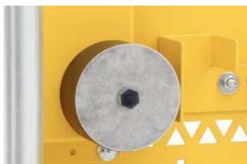
Sealed Steel Material Bearings