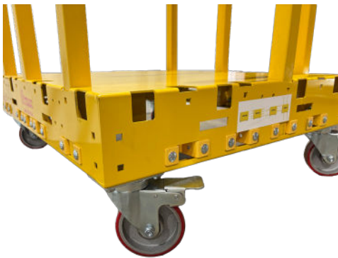
EACH WHEEL HAS A FOOT PETAL BREAK

The all-steel, US made, uni-bodybox has a solid base to carry up to 1000lbs. Based on the same steel platform as our yel-Low Safety Dolly, our Rack & Roll Safety Dolly features 3" locking stem and wheel casters. These casters are mounted to the corners of the dolly giving it more ground clearance than the yel-low safety Dolly. When wanting the low profile of the yel-Low Safety Dolly, but needing the feature of locking casters, the Rack & Roll Safety Dolly is the perfect choice.