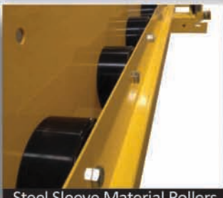
Steel Sleeve Material Rollers