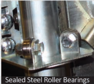
Sealed Steel Roller Bearings