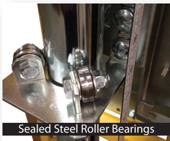
Sealed Steel Roller Bearings