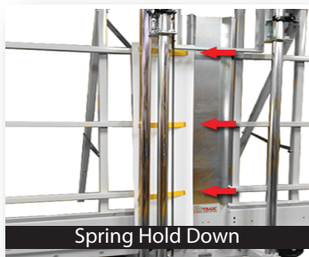
Spring Hold Down