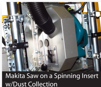
Makita Saw on a Spinning Insert w/Dust Collection