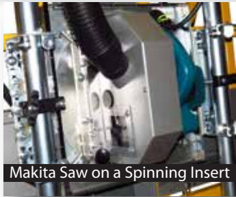
Makita Saw on a Spinning Insert