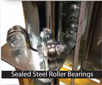
Sealed Steel Roller Bearings