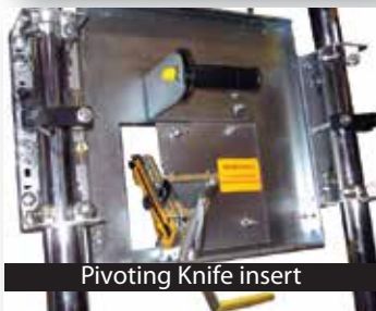
Pivoting Knife insert