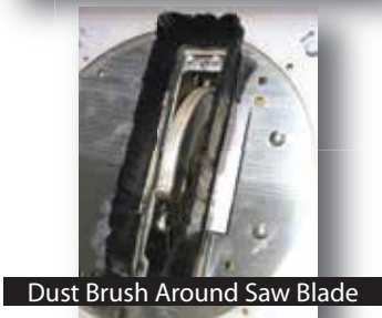
Dust Brush Around Saw Blade