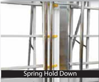
Spring Hold Down