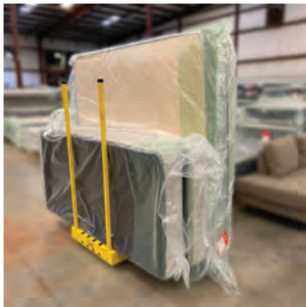
Mattress Shuttle Dolly

The Fulfillment Shuttle dolly is ideal for warehouse operations. With the wheelbarrow handles, loads can be transported without touching the product. Instead of turning a loaded dolly around in a confined space, the wheelbarrow handles can be removed and inserted in the other end.