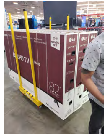
Base Shuttle Dolly

The Fulfillment Shuttle dolly is ideal for warehouse operations. With the wheelbarrow handles, loads can be transported without touching the product. Instead of turning a loaded dolly around in a confined space, the wheelbarrow handles can be removed and inserted in the other end.