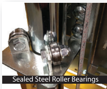
Sealed Steel Roller Bearings