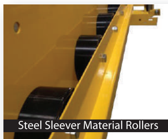
Steel Sleeve Material Rollers