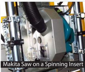
Makita Saw on a Spinning Insert