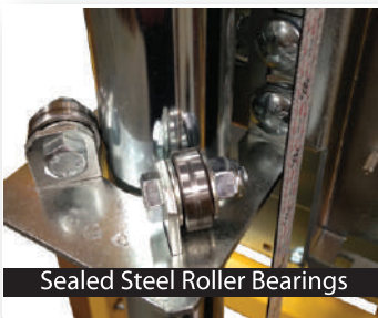
Sealed Steel Roller Bearings