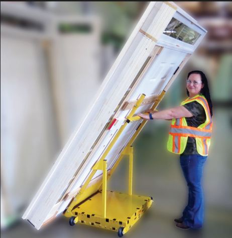
Load Remains Stable, Even When Tilted Back - No Operator Needed

Eliminate lifting injuries & workman's comp claims!