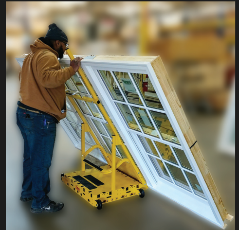
Just Load - And Roll, or Walk Away!